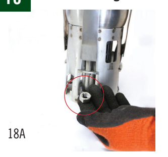
Place NUTS to tighten STRAPS using SOCKET FOR STRAP

Use "food grade never seize" on threads of straps to prevent galling